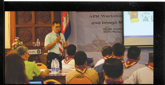
APR Workshop on Branding and Image Management Cambodia 25-28 September 2013