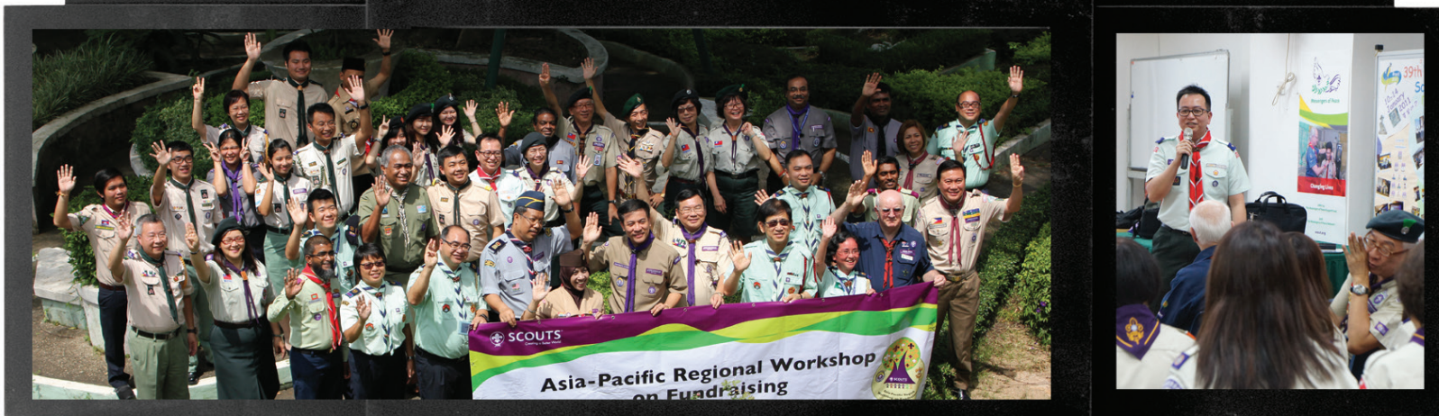
APR Workshop on Fundraising Macau 5-8 July 2014 APR Workshop on Partnership and Self-Reliance Philippines 17-20 September 2015