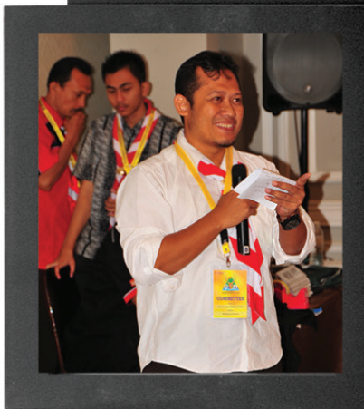
APR Marketing and Communication Workshop Indonesia 27-30 September 2014