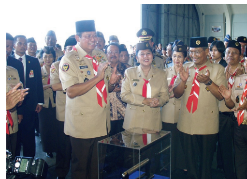
Indonesian President Susilo Bambang Yudhoyono and the First Lady Ani Yudhoyono with the leaders and Scouts of Gerakan Pramuka during the stop of Rover Peace Baton in Indonesia in 2006.

The baton is made of brass metal that signifies strength of character and love for peace. The joint baton symbolizes unity.