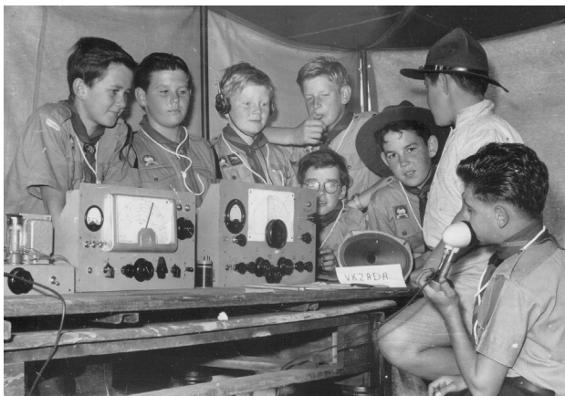
The 4 th Camden Group in New South Wales, Australia taking part in the 4 th JOTA with VK2ADA.

London hosted JOTA station GB3BPH. The Bureau's Regional Office in Mexico City operated for the first time with XE1ASM.